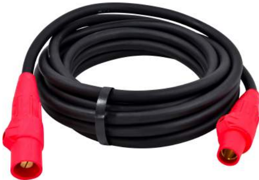
TYPE SC W/CAM-LOK FEEDER CABLE