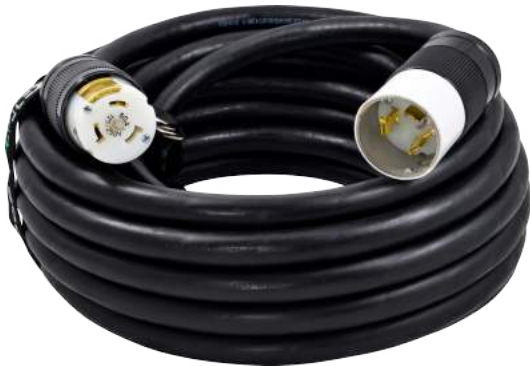
TYPE W W/EDISON EXTENSION