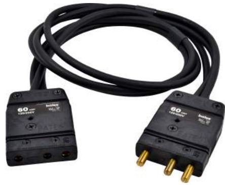
TYPE SC W/STAGE PIN EXTENSION