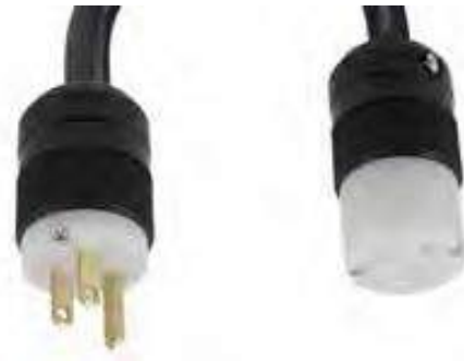
S00W W/STRAIGHT BLADE EDISON EXTENSION