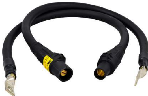
TYPE SC W/PIGTAILS