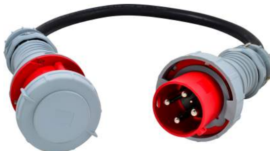
TYPE W W/PIN & SLEEVE