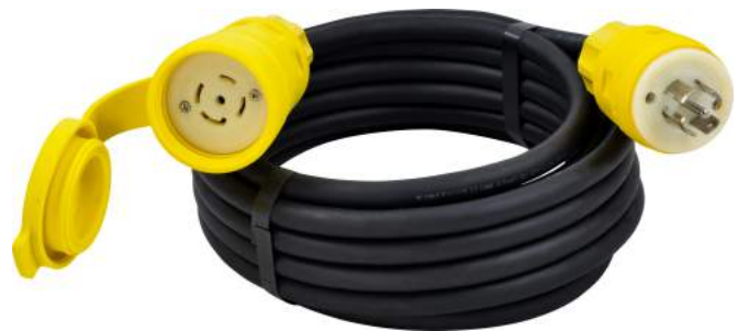
S00W W/WET-GUARD WATERTIGHT EXTENSION