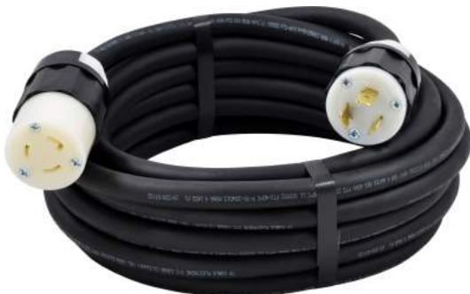
S00W W/TWIST-LOCK EDISON EXTENSION